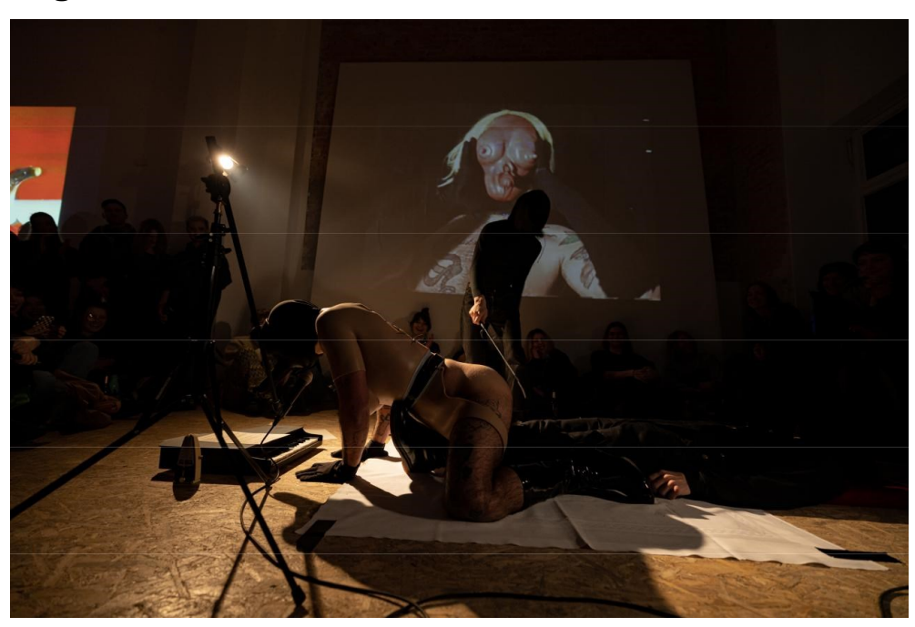
'THERE IS NOTHING BEAUTIFU'L' ABOUT ME' PERFORMANCE / MOLT - BERLIN 2023