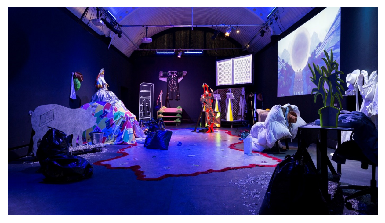
2019_RMA_VFBFRT_Wysing Arts Centre