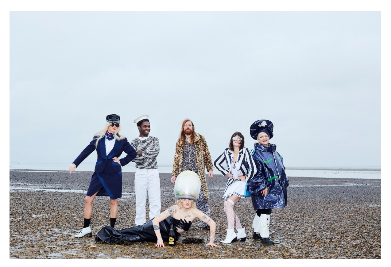
H.M.S RMA