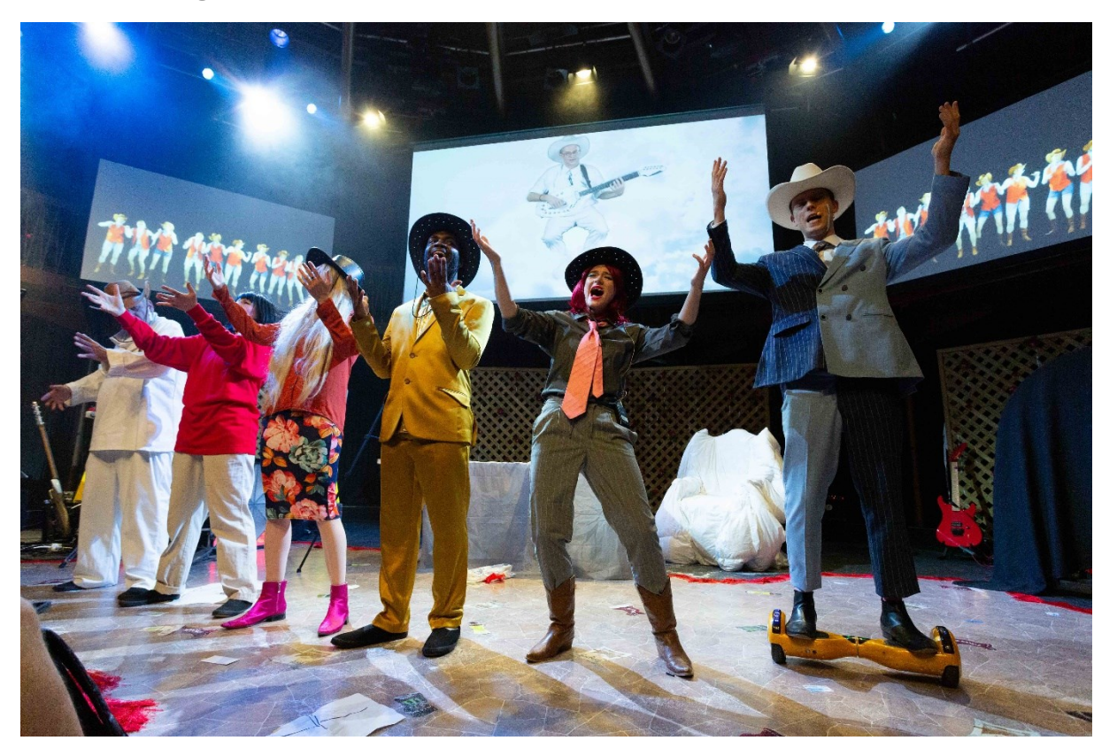
1. Ravioli Me Away. View from Behind the Futuristic Rose Trellis. 2019. The Albany.